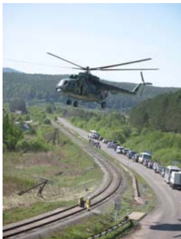
Exercise – Chelyabinsk region, Russia, May 2010

On May 16, 2010 the Urals Research Center for Radiation Medicine (URCRM) medical-dosimetric team participated in a special-purpose exercise, organized and conducted by the Antiterrorist Committee in Chelyabinsk Oblast. The aim of the exercise was to practice interaction between different organizations in rendering medical assistance to patients with acute radiation injuries under the conditions of an imminent terroristic threat. ◆