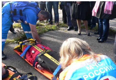
Exercise – Off-board assistance, St. Petersburg, Russia, September 2010

The aeromobile helicopter medical module (HMM) mounted on the helicopter MI-8 was tested in the exercise. Further, medical assistance for injured people on and off board the helicopter was demonstrated as well as medical equipment for emergency medical assistance and of the mobile medical module. ◆