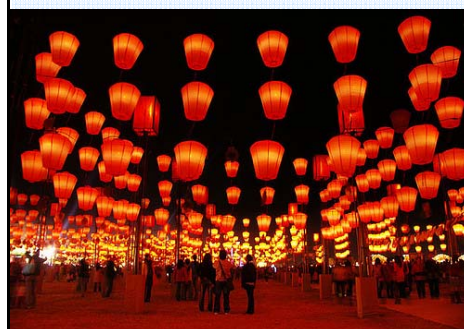
Lantern Festival in Nagasaki