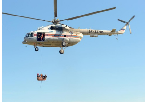
Exercise – Helicopter medical module (HMM), St. Petersburg, Russia, September 2010

The exercise “Aeromobile medical technologies in transboundary emergencies” took place during an international seminar in St. Petersburg, Russia, on September 07-10, 2010 organized by the Ministry of Russian Federation for Civil Defence, Emergencies and Elimination of Consequences of Natural Disasters (EMERCOM).